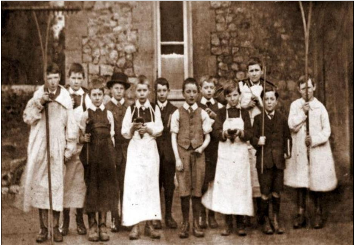
A group of boys presumably involved in an occupation project. This photo and the one below were taken outside the school house front room window. The school house would have been occupied by the Head teacher.

The following two photos are newspaper cuttings.