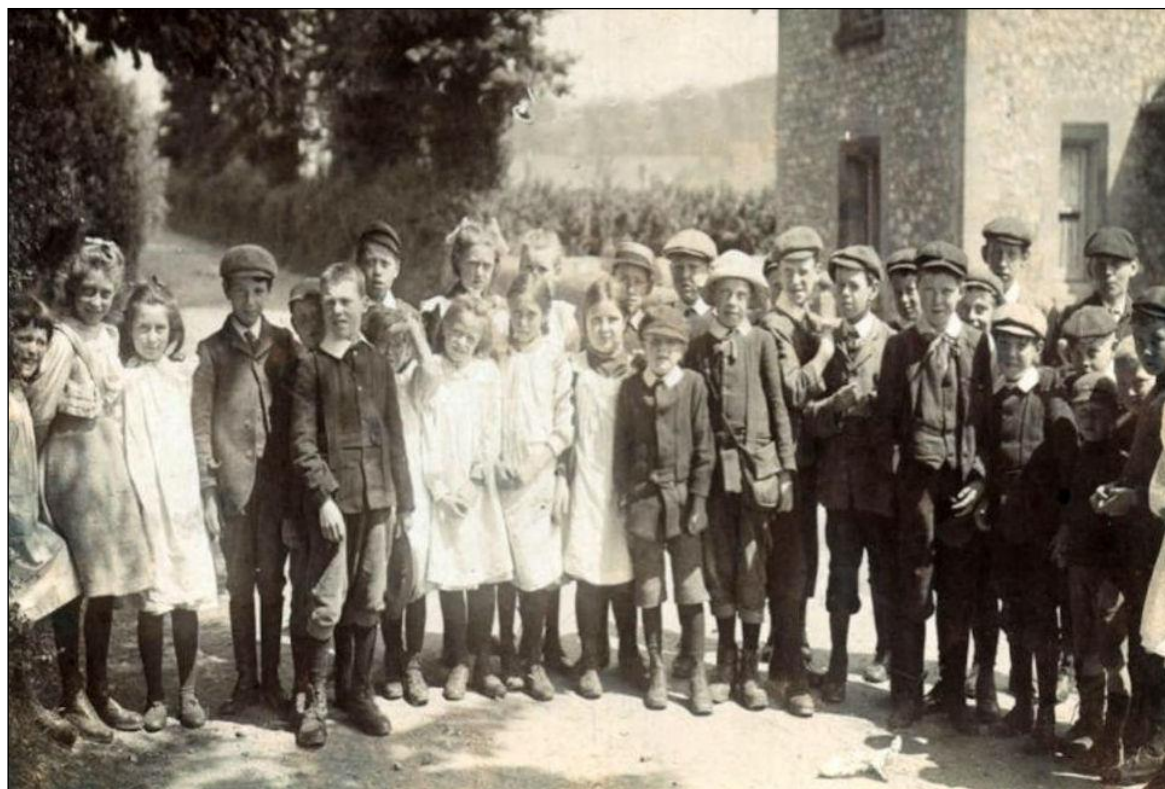
Photo taken outside the school on Lower Sea Lane. Notice nearly all the boys are wearing caps which was quite common until the 1950s. This picture appears earlier in the book, but this is a much clearer picture and includes more children on both sides of the photo.