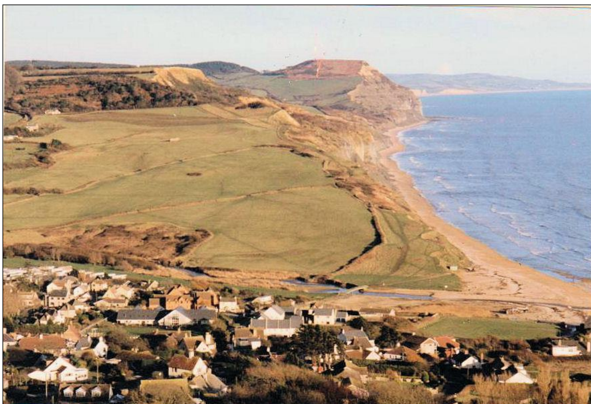
This photo shows how close the new school is to the sea front. When the school was first built it was possible to sit on the top of the steps leading to the main entrance and watch and hear the tide coming in, but that view has been blotted out by the trees and hedges that have since been planted totally altering the front of the school.