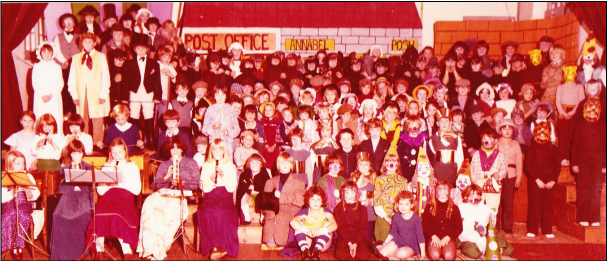
The Pied Piper.