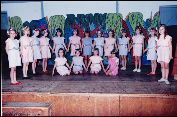
Peter Pan - 1977