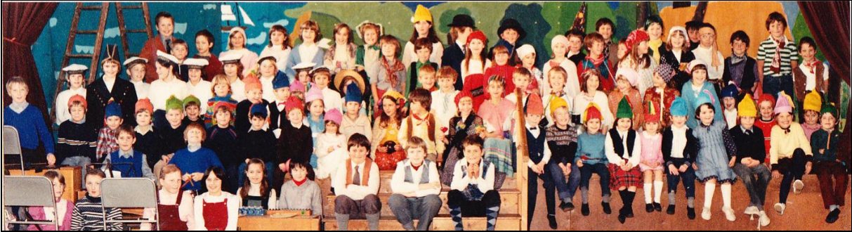
The Four Seasons – 1983.