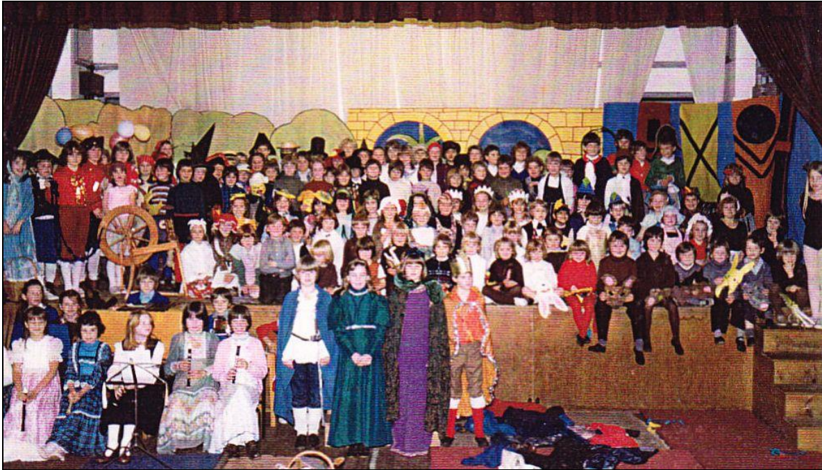
Dinosaurs and all that Rubbish – 1980.