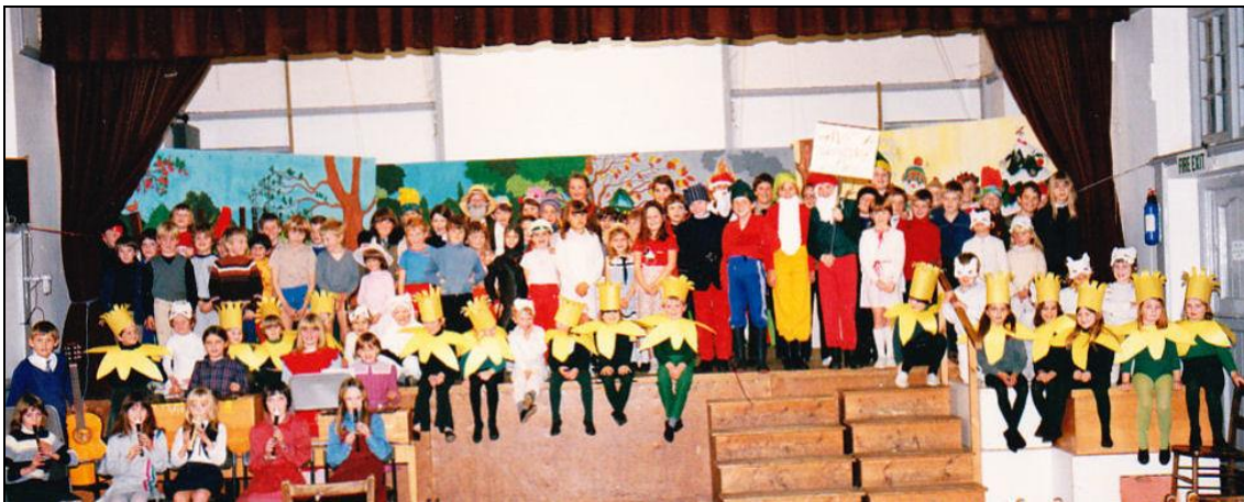
A King Forever – The Nativity – 1990.