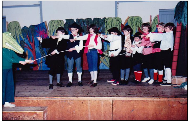
The Pied Piper – 1978