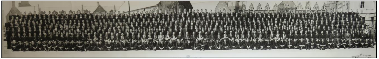
Rossall School 1954