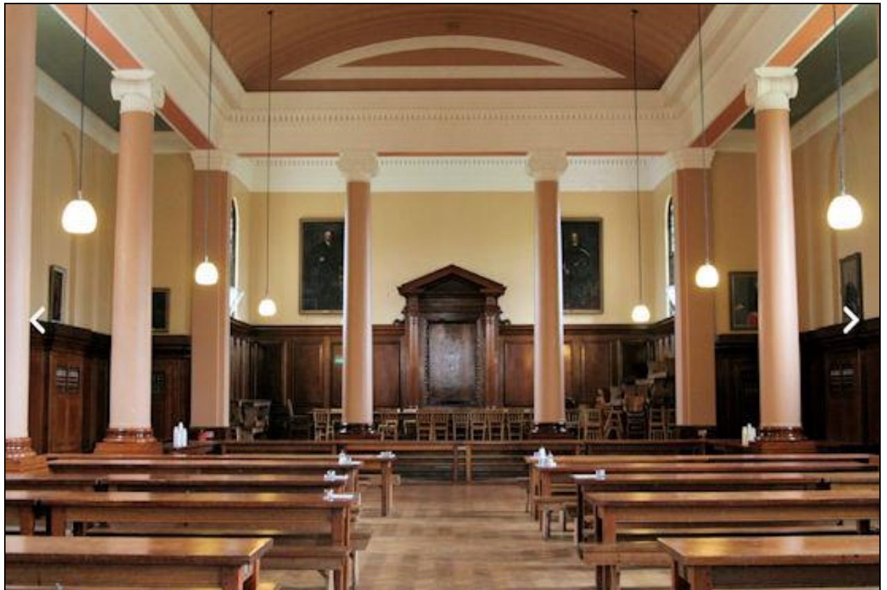
The inside of the dining hall. The Headmaster's table is on the small stage. Meals were eaten very quickly to be prepared in the event of there being second helpings! The original dining hall had burnt down in 1929.