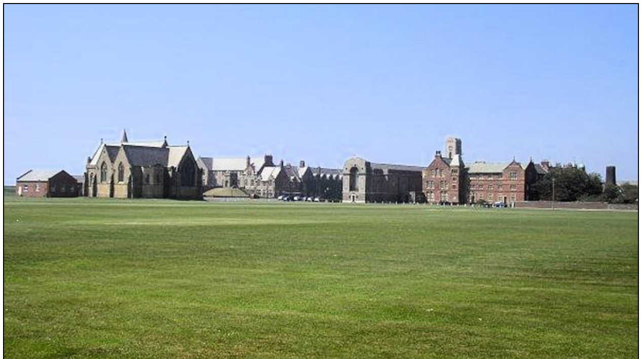
This picture shows the School Chapel in relation to Mitre House and the Dining Hall